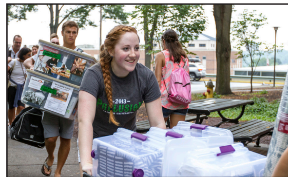
Prelusion Participants Volunteer at First-Year Move-In