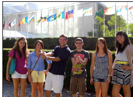
Prelusion Participants in New York City